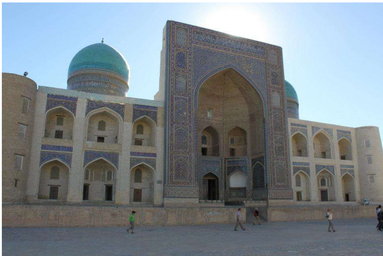
The Blue domes under the sun